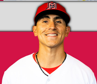
TRES BARRERA C